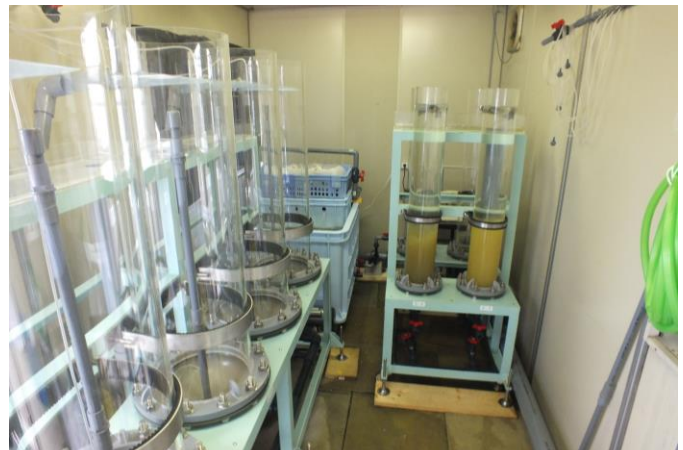
Activities by fishermen